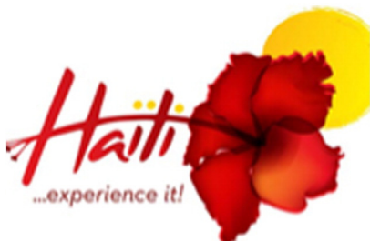
Fig. 1. New logo Haitian DMO.

The study is a prolongation of a study by Muller, Kocher, and Crettaz (2013, p.86), in the sense that their study advocates the change of logo as being positive for a brand as “the introduction of a new logo leads consumers to perceive a brand as modern.” However, their study does not consider specific elements constituting logos (e.g. shape and color). Color is an important focus of this study because, alongside corporate name and type-face, design is also one of the main factors that